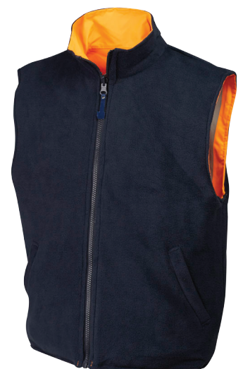
Inner Vest Reversed