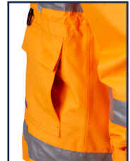
Hand warmer pockets