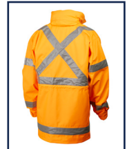
NSW-Rail Hi-Vis back with 'H' pattern reflective tape